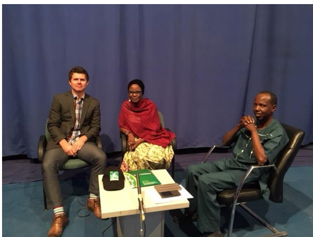
Equal Access International TV Interview on Borno Radio and TV, Borno