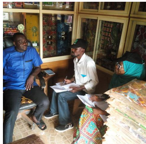
Interview with a self-defense group leader, Plateau

One traditional leader said, “All must get involved. Scholars have a role to play and it is a huge task. We need to work