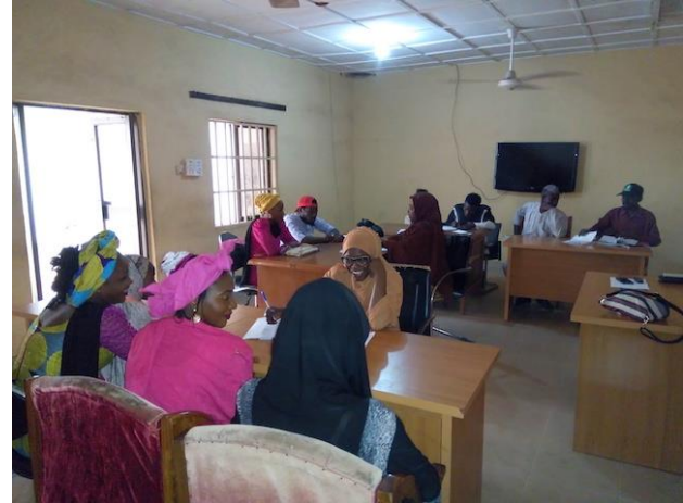
Focus group with LDAG participants, Nasarawa