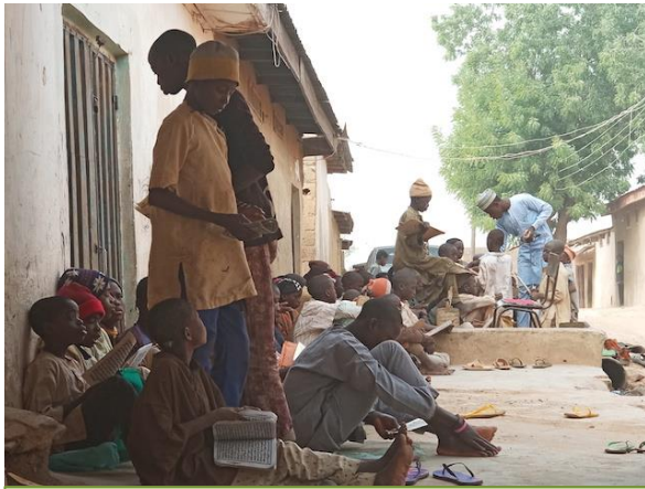
Tsangaya school students, Katsina

Supported by scholars with the Aafaq Educational Foundation and numerous other well regarded Islamic scholars and religious leaders, Ilimi Abin Nema (“The Pursuit of Knowledge”) has become part of the national dialogue about the role and structure of Islamic schools, the life of an Almajiri , 3 the role of non-religious education in the North, the relationship between Islamism and the Boko Haram insurgency, Islamic schooling in other parts of the world, and the promotion of values of non-violence, inclusion, women’s rights, and tolerance. The show helps to facilitate a discussion with key leaders about the responsibility of the government and religious leaders to standardize Koranic educational curricula in Islamiyya and Tsangaya schools. The program aims both to encourage stronger curriculum, as well as reduce stigma associated with religious schools among the population at large.