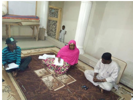
Interview with Bauchi State House of Assembly member, Bauchi