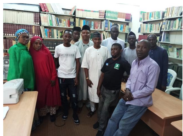
Focus group with LDAG, Kaduna