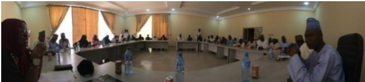
Focus group with LDAG members, community and religious leaders, and a women's association, Borno