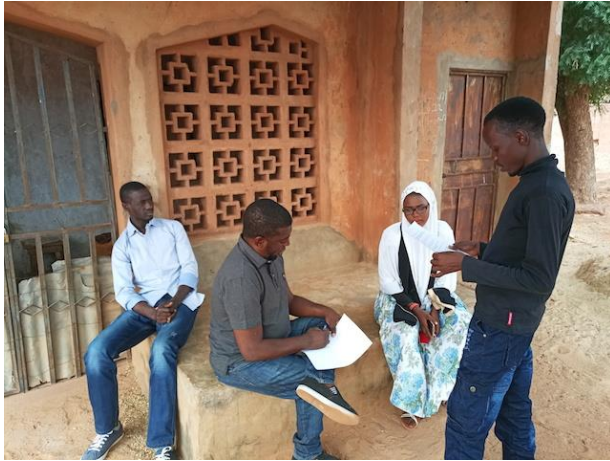
Interview with WhatsApp participants, Sokoto