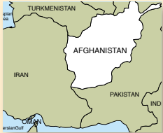
Farmer from Herat, Afghanistan

“I have learned lots of things about agriculture and cultivation from these programs, for example, I didn’t know about crop rotation and what to cultivate in which season and I learned these things from your programs. These radio shows taught me about the time and method of wheat plantation. Also in the past when we were reaping the wheat, we were leaving it in the field for at least 10 days. But now we know that we have to harvest the wheat as soon as possible. Through your show and my listening group I also learned about irrigation and the method and times for watering. I will be so happy to have more programs for farmers as we are not literate, and this radio knowledge benefits us all.”